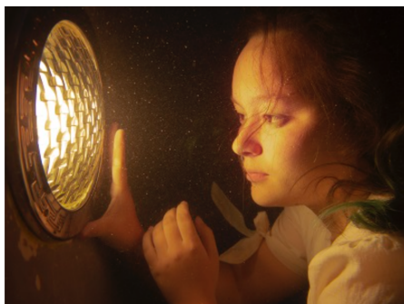
Photography winner for the California State PTA 2019-2020

The PTA Reflections Program encourages students to explore the Arts! This year's theme is "I Matter Because...." Students reflect on the theme, create an original work, and are recognized for their work. All Cupertino High Students are invited to enter.